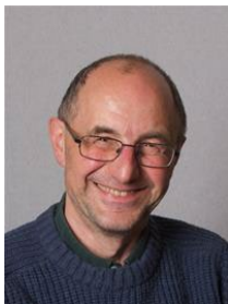
Cllr Dafydd Meurig Plaid Cymru